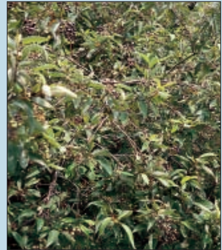
Autumn olive ( Eleagnus umbellata ) [above left] is an exotic, double-edged sword. While its fruits are relished by birds, the plants are easily spread and can form dense thickets that block sunlight. Other shrubs and tree species cannot germinate or compete and are effectively excluded, resulting in a loss of native plant diversity. A better choice for a habitat garden would be the native silky dogwood ( Cornus amomum ) [above right], whose berries are equally rivaled.