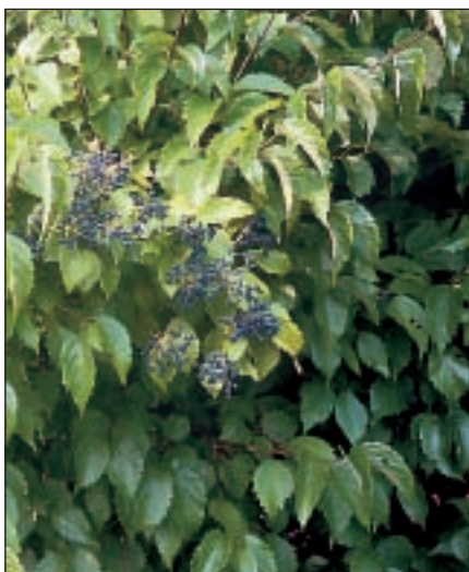
A bird garden might include trumpet honeysuckle ( Lonicera sempervirens ) [below left]; its tubular shaped flowers attract hummingbirds. Arrowwood viburnum ( Viburnum dentatum ) [above] and American holly ( Ilex americana ) [above right] provide berries and cover.

fruit and deciduous shrubs that produce nectar. As with any gardening, make sure you use the right plant in the right place. A buttonbush which requires moist loamy soils is doomed in dry soils that are heavy with clay and that lack sufficient organic matter to hold moisture. A holly will grow very sparse branches if sequestered under heavy shade, but it will perform handsomely in full sunlight.