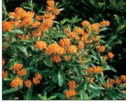
Black-eyed Susans ( Rudbeckia hirta ) [left] and butterfly-weed ( Asclepias tuberosa ) [right] are good nectar sources for butterflies and can tolerate dry conditions.

T here's an effort underway today by conservation-minded individuals to fill in the habitat gaps that exist in and around our highly paved and populated towns and cities. Although we can not turn back and un-build or un-populate suburbia, we can make an effort to restore—if only on a very small scale—some of the habitat features that are being usurped by the construction boom. The natural landscaping movement that is now sweeping the country illustrates a recognition that each of us can be part of a solution.