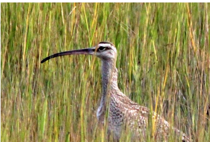
Whimbrel in the cord grass at Oyster (10/16/2022).

We then continued by car up to the seaside town of Oyster to walk the Horse Island Trail. Perfect mid tides concentrated shorebirds on sporadically exposed oyster reefs. We saw very large numbers (200-300) of both Willet and American Oystercatcher. There were flocks of Short-billed Dowitcher and Dunlin. We had a group flyover of Blue-winged Teal and a brief view of Saltmarsh Sparrow. The birds of the day were great looks at three Marbled Godwit and four Whimbrel with one foraging in the marsh at extremely close range.