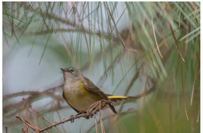
American Redstart Bronze by Pete Peterman

“As always, the photo was taken with my Nikon Coolpix B500; the Snowy Egret was feeding right off my deck on the South Branch of Salter's Creek in downtown Hampton. I spend a lot of time just watching all the shore birds feed.”