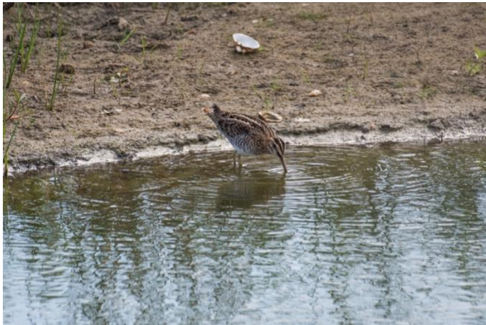
Wilson's Snipe Bronze by Pete Peterman

Powershot SX60 HS. It was on auto focus and at approximately 100x zoom.”