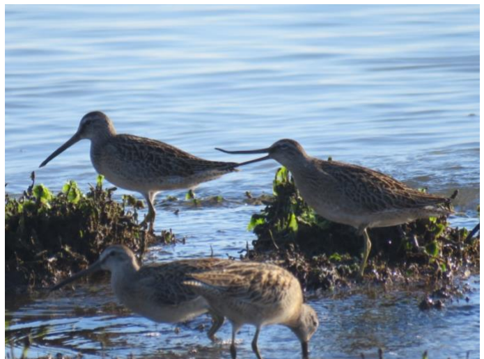
Short-billed Dowitcher Silver

“Both photos [see also the Wilson's Snipe on next page winning Bronze, Ed.] were taken at Back Bay NWR on September 10 using a Nikon 200-500 mm lens at 1/1000 sec @ f/5.6. The King Rail was spotted by Stuart Sweetman and proceeded to give us great views for the next 3-5 minutes.”