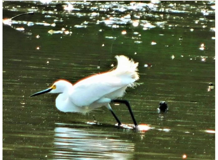
Snowy Egret Silver by Lynn Chandler

Bridge. It stopped for less than 30 seconds in a branch to check us out and then flew away.”