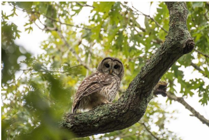
Barred Owl Gold by Pete Peterman

“Both photos [see also American Redstart to immediate right winning Bronze, Ed.] were taken at Newport News Park on October 2 using a Nikon D500 with a Nikon 200-500 mm lens at 1/1000 sec at @ f/5.6. The Barred Owl was spotted by Stuart Sweetman as it flew over our heads as we proceeded along the White Oak Trail going to the Swamp.