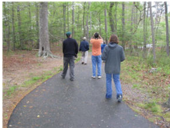
Walking towards the water