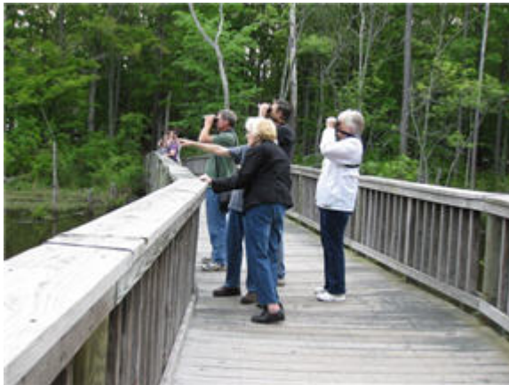
The first bridge by Ranger Station

Fred also provided these photos of the group.