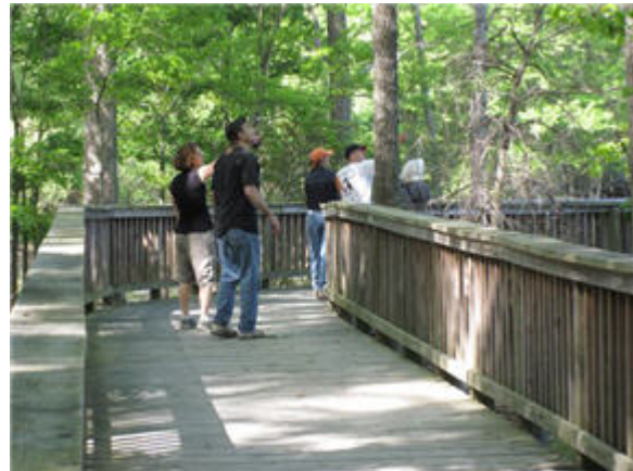
Spawning Pond Bridge