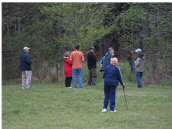
Looking for birds