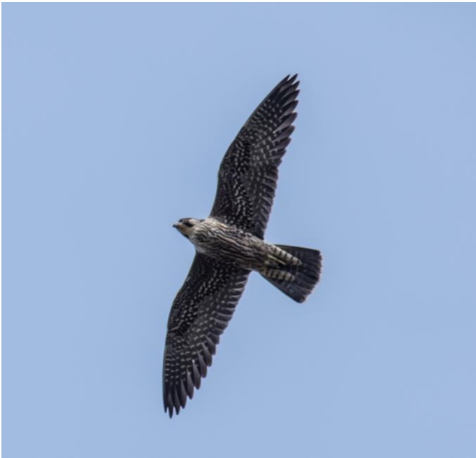
Peregrine Falcon Gold by Pete Peterman

Pete: "The Peregrine was photographed at Gateway National Recreation Area in Sandy Hook, NJ. I used the Nikon D500 with a 200-500 mm lens and a setting of 1/1250 sec @f 5.6 at the 500 mm setting and an ISO of 100. The sky was clear with many birds diving for cover. A Merlin was found nearby sitting in a tree."