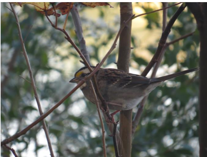
White-throated Sparrow Silver