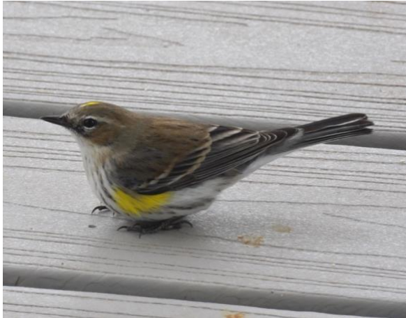
Yellow-rumped Warbler Honorable Mention by Lynn Chandler

Lynn: "Yellow-rump warbler took a long rest on my deck after eating some peanut butter; otherwise I would never had gotten the shot! Picture taken on Saturday, January 24th at 12:02pm."