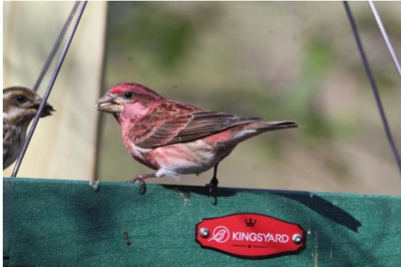
Male Purple Finch in Gloucester during March