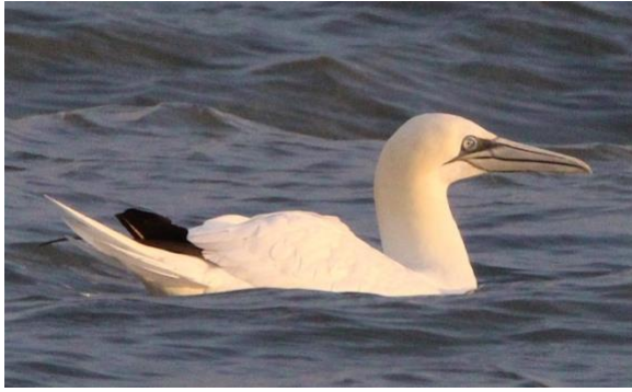
Northern Gannett at Huntington Beach State Park in South Carolina in February