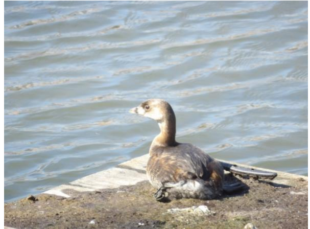
Pied-billed Grebe Silver by Lynn Chandler

Lynn: "Yellow-rump warbler took a long rest on my deck after eating some peanut butter; otherwise I would never had gotten the shot! Picture taken on Saturday, January 24th at 12:02pm."