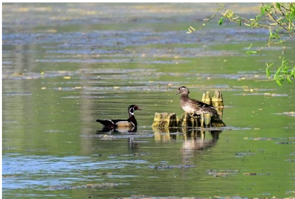
Wood Ducks Gold