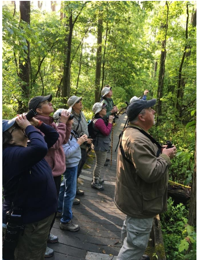
A high, but still comfortable viewing angle from the boardwalk at Washington Ditch.