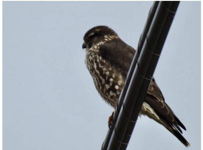
Merlin Silver