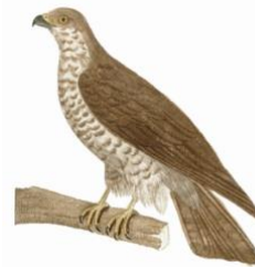
La Buse (Leclerc)

NOTE: As you may have noticed, I'm using a new email address: phrogdolph@gmail.com . Please update your contact list accordingly.