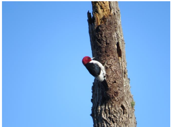
Red-headed Woodpecker Gold

Bill: “I took the picture during the Sunday park walk on April 2. The snag was along the shoreline adjacent to the White Oak Trail between the spawning pond and the Swamp Bridge. I was using my trusty Canon SX50.”