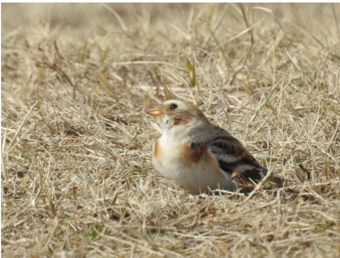
Snow Bunting Gold