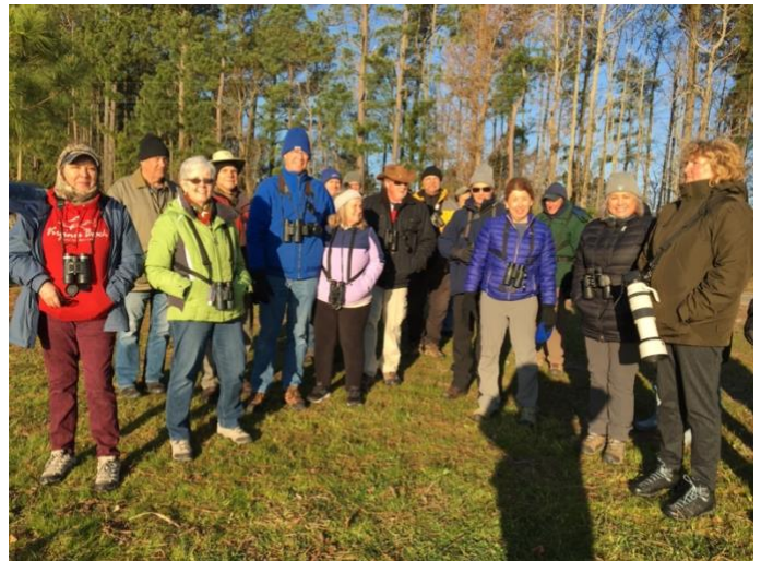
Backs 100m from the shore of the James on the western portion of Hog Island

On March 19 the Hampton Roads Bird Club journeyed to the Hog Island Wildlife Management Area (WMA) in Surry County, Virginia. It was cool and breezy, but there was lots of bird activity. The trip had 24 participants. We drove the main road through the WMA and walked some of the side roads. We observed 49 species with the highlights being great looks at American White Pelican, Tundra Swan, many Northern Shoveler, and two Northern Pintail. An early Pectoral Sandpiper along with some participant's lifer Horned Lark were additional exciting sightings.