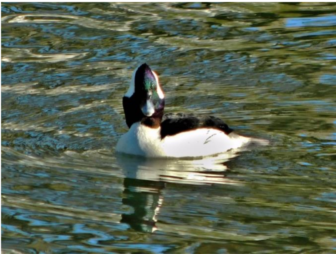
Bufflehead Bronze by Lynn Chandler

If you'd like to participate in this effort, go to the OspreyWatch website: https://www.osprey-watch.org/